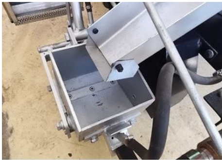
Marking shoe & Paints Exit