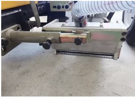
Glass beads Dispenser