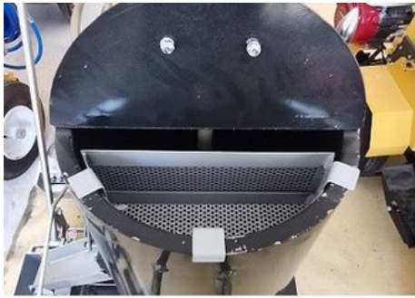
Paint Tank & Filter

Nozzle: The increased nozzle on top of the outlet port and two nozzle behind of marking shoes can keep the temperature of the paint about 180 from outlet port to the ground.