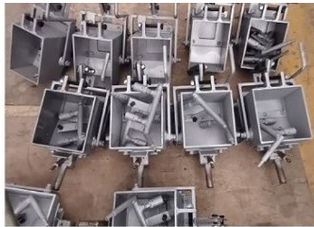
Different size marking shoes

The Marking shoes made by alloy material, It can keep marking the beautiful lines when the road is not flat. Simple structure , easy to disassemble, change and maintain. We have different size shoes to be chose, 10cm, 15cm, 20cm, 30cm, 40cm, 45cm or customized.