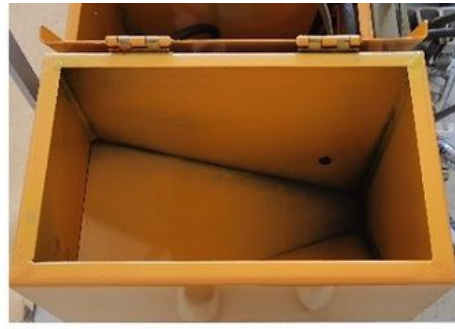
Glass beads tank

Paint tank Increasing the tank volume to 125L, It can melt more paint onetime to save time and improve efficiency.