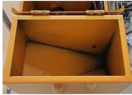
Glass beads tank

Paint tank Increasing the tank volume to 125L, It can melt more paint onetime to save time and improve efficiency.