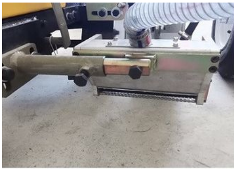
Glass beads Dispenser