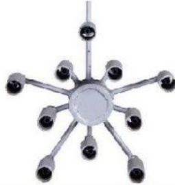
Direct injection furnace