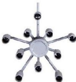
Direct injection furnace