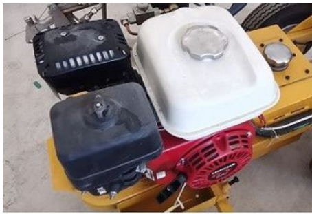
5.5 HP gasoline engine